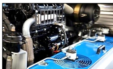
Patented Cooling System