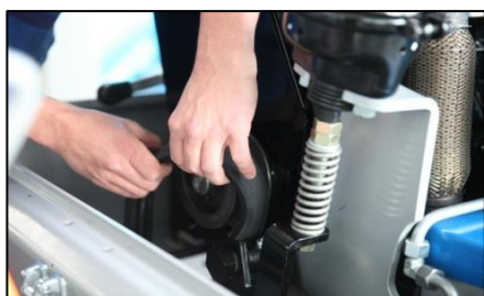
Easy Belt Replacement