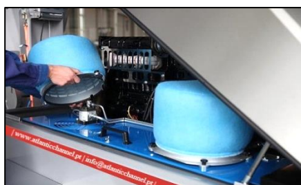
Twin Hydraulic Driven Cooling Fans